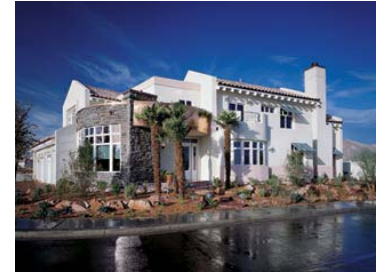
New American Home, 1993 Las Vegas, Nevada

What's more, Dryvit standard, specialty and elastomeric finishes, as well as coatings, offer low maintenance advantages such as DPR (Dirt Pickup Resistance) and PMR™ (Proven Mildew Resistance). Dryvit presents a wide range of custom colors and textures for any architectural style on new or retrofit projects – all with written Dryvit materials warranty.